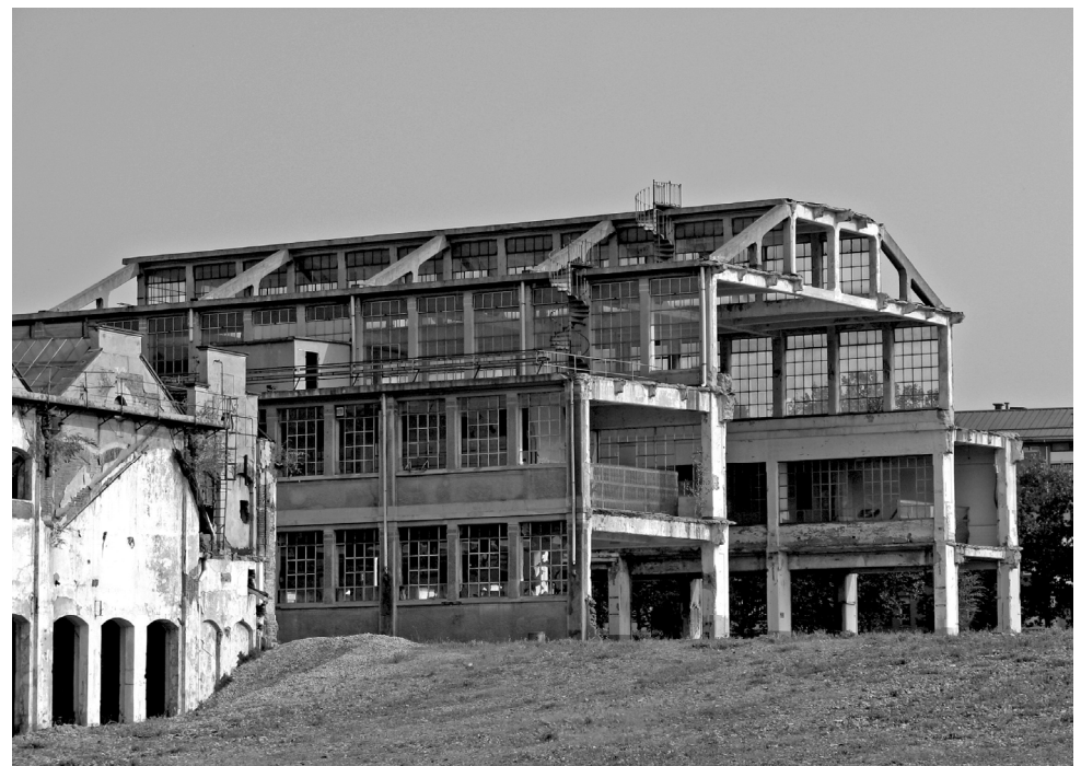
Fig. 2 Skeleton of the Officine Grandi Motori, Fiat, Turin (October 2017). Photos of Paola Gregory, Loneliness .